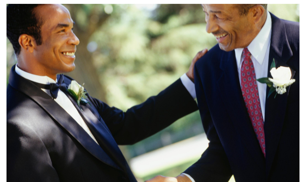
shi?híy sheeh-hee (father in-law)