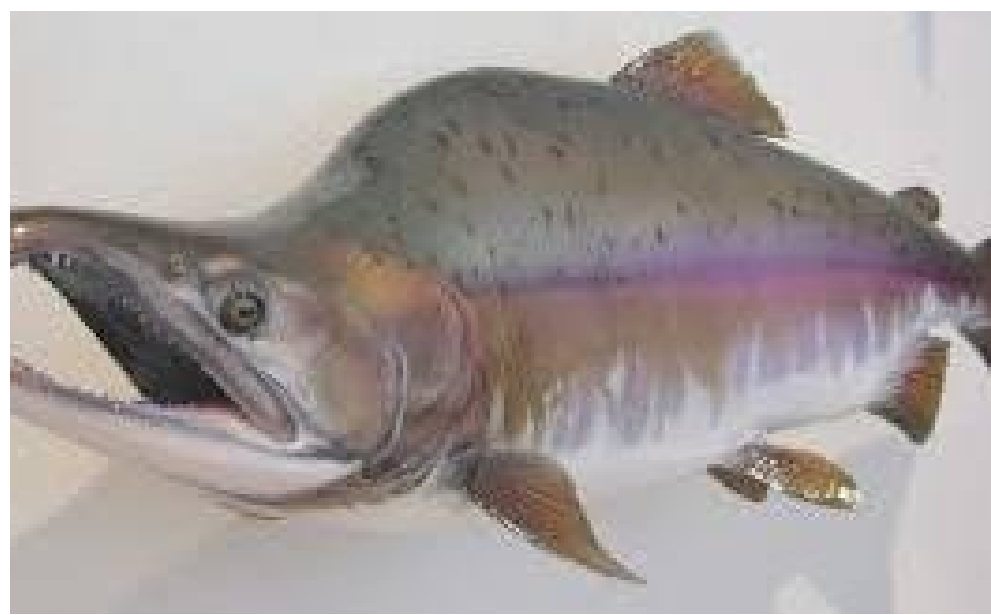
héni? hen-eeh (humpback salmon)