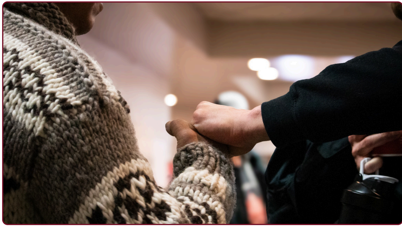
Coyote Brotherhood and Dude's Club leaders shake hands in solidarity.

nle?képmx Territory - On the weekend of February 16th, the halls of the Merritt Civic Centre came to life with the energy of men from various communities that gathered together for a transformative Men's Group Wellness Conference. The two-day event was hosted by Coyote Brotherhood in collaboration with the Indian Residential School Survivor Society, Dudes Club, Scw'exmx Child and Family Services, Nlaka'pamux Health and various nle?képmx bands, alongside Citxw Nlaka'pamux Assembly (CNA). Together, they created an environment that prompted creativity, healing and friendship among attendees.