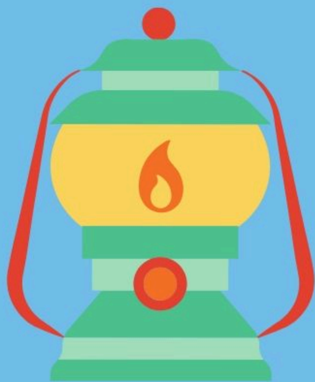
lamp, light, lantern