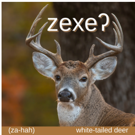
(za-hah) white-tailed deer