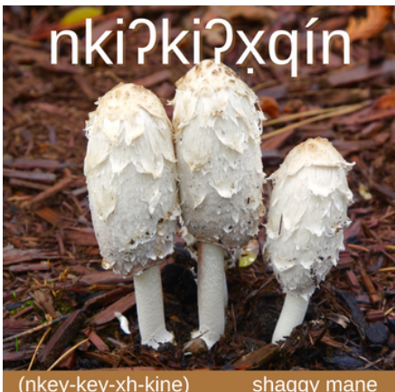
(nkey-key-xh-kine) shaggy mane