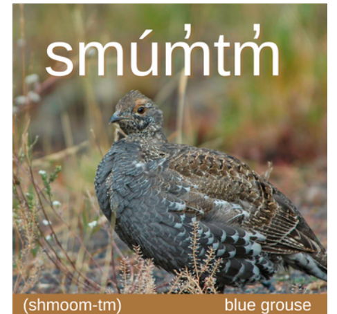
(shmoom-tm) blue grouse

For more information, contact language@cna-trust.ca or call 250-378-1864.